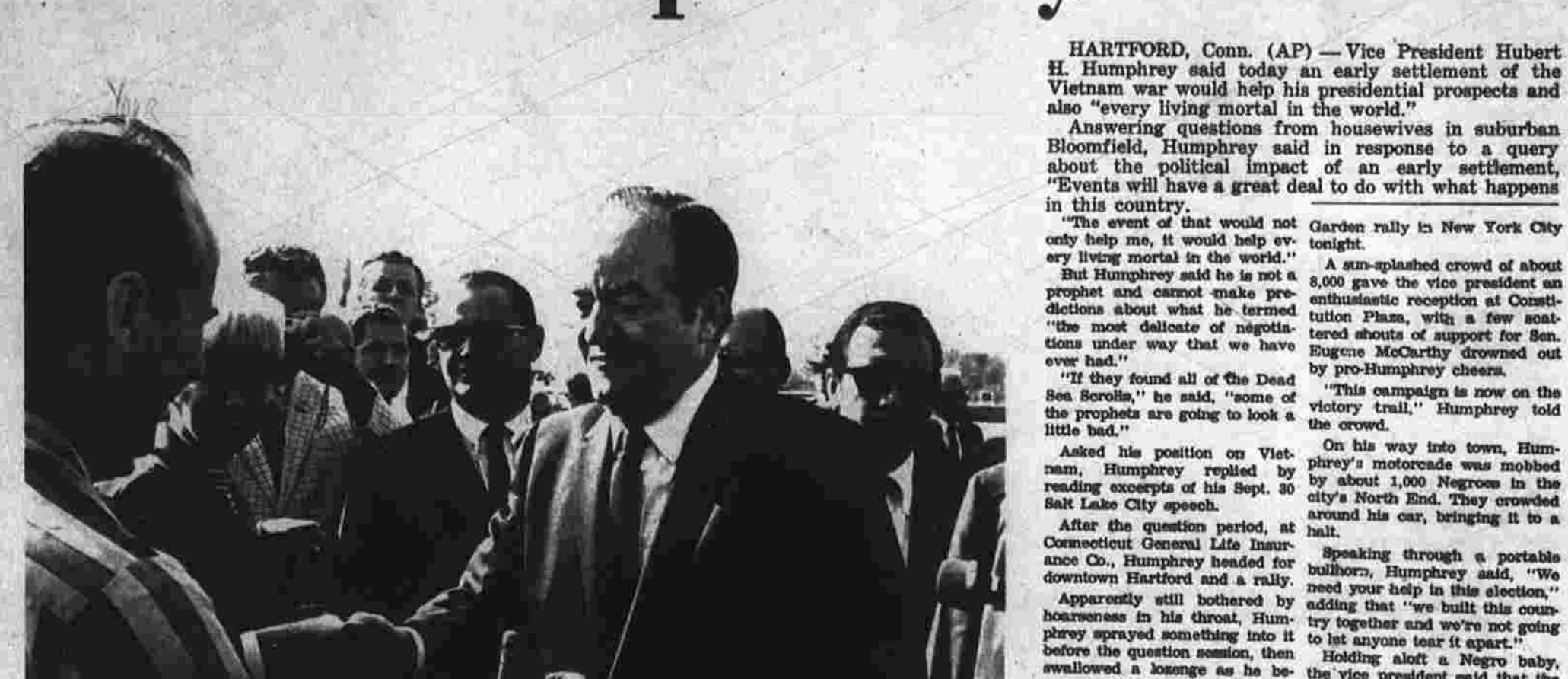
Vice President Humphrey is greeted upon his arrival this morning at Bradley Field.

He added that he had "nursed" the telephone all day, but nothing came through.